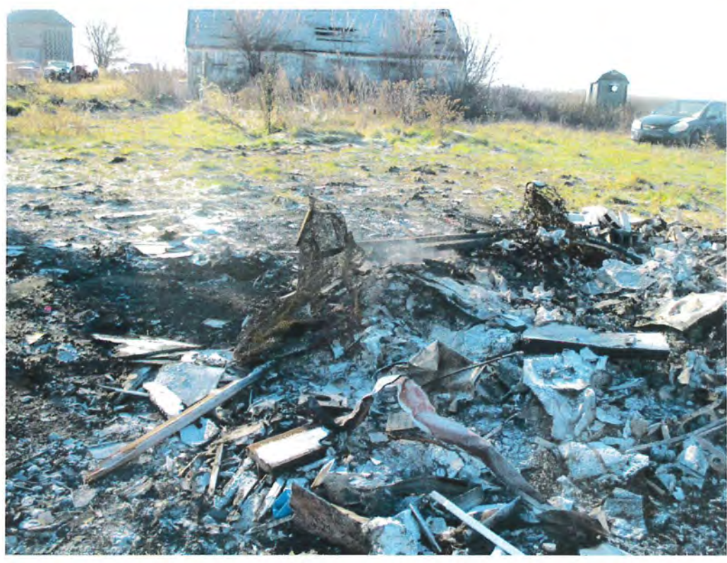
Date: 11/2/2023 Time: 9:41 AM Direction: South Photo by: M. Lakan Exposure #: 6 Comments: fifth burn pile smoldering

Date: 11/2/2023 Time: 9:41 AM Direction: Northeast Photo by: M. Lakan Exposure #: 5 Comments: fourth burn pile.