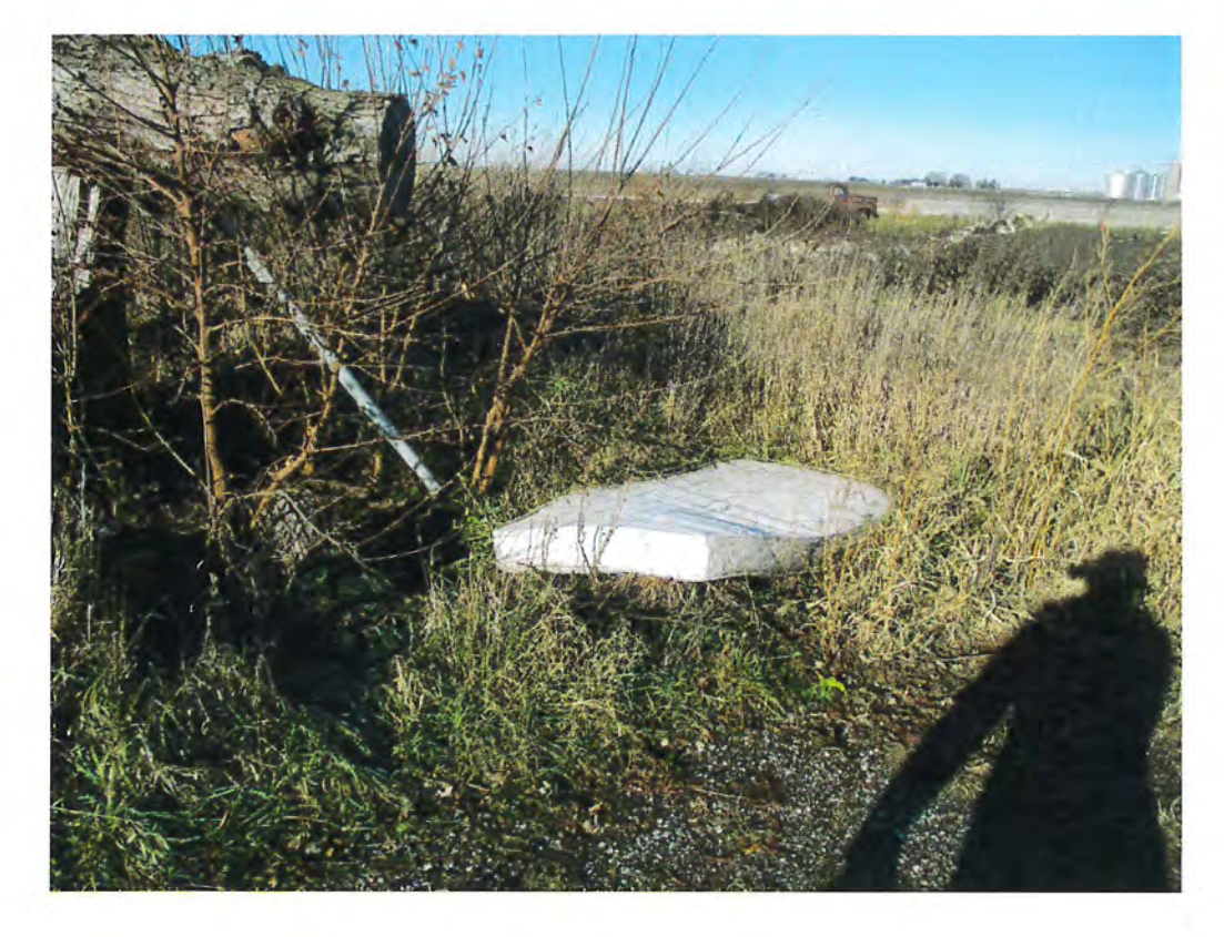
Date: 11/2/2023 Time: 9:44 AM Direction: Northwest Photo by: M. Lakan Exposure #: 14 Comments: mattress

Date: 11/2/2023 Time: 9:44 AM Direction: Southeast Photo by: M. Lakan Exposure #: 13 Comments: more scrap metal and toilet