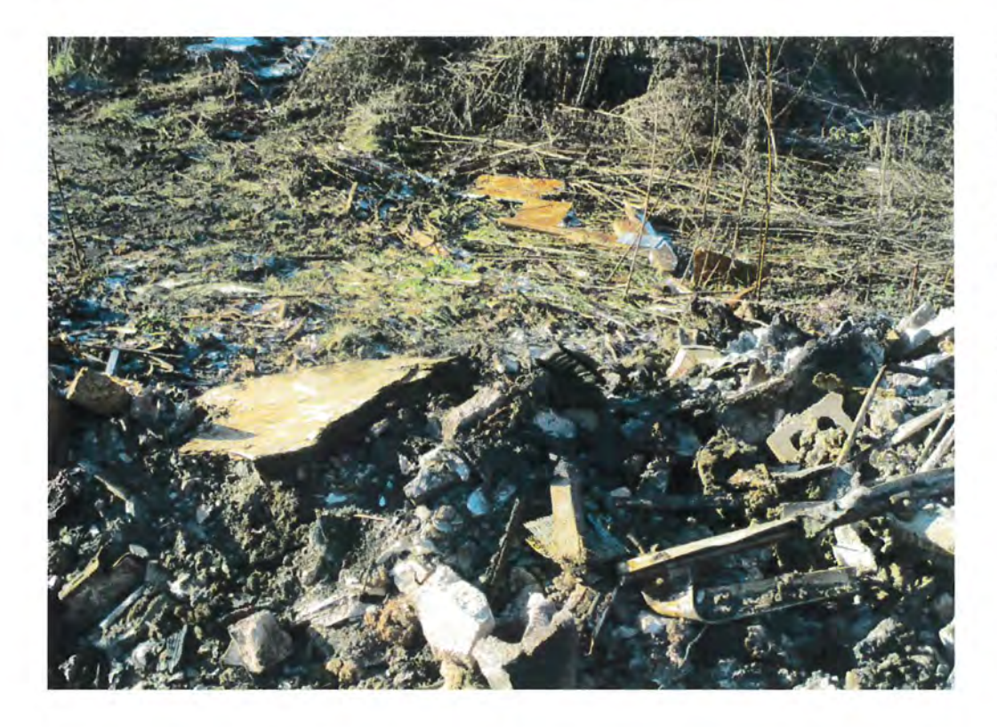
Date: 11/2/2023 Time: 9:39 AM Direction: Southwest Photo by: M. Lakan Exposure #:2 Comments: Gutters, wood, metal and other misc. debris in the burn pile.

Date: 11/2/2023 Time: 9:39 AM Direction: South Photo by: M. Lakan Exposure #: 1 Comments: Burn pile with construction debris.